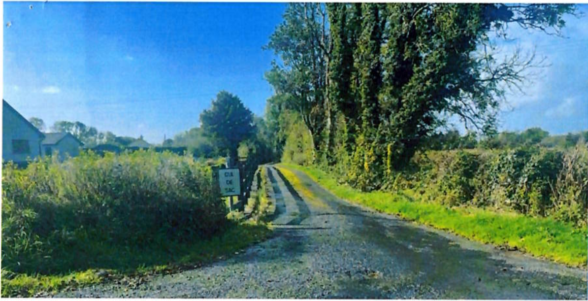
Fig3: Photograph dated 09/2023 showing location of new fence.