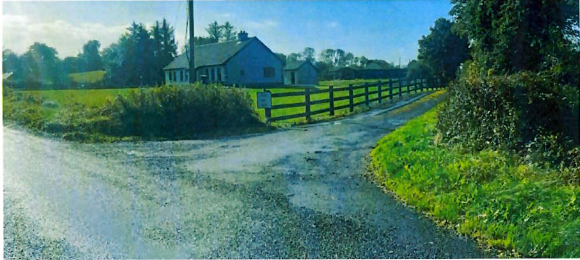
Fig1: Photograph dated 09/2023 showing distance of fence to Breaffy road junction.

It is entirely false to state that there is now difficulty turning out onto the Breaffy road from the private road. The fence does not interfere in any way with the junction. As illustrated in the picture below (Fig 1), the fence starts 5m back from the road junction and the original hedgerow at the road junction was left in place. No interference or changes were made to the road junction.