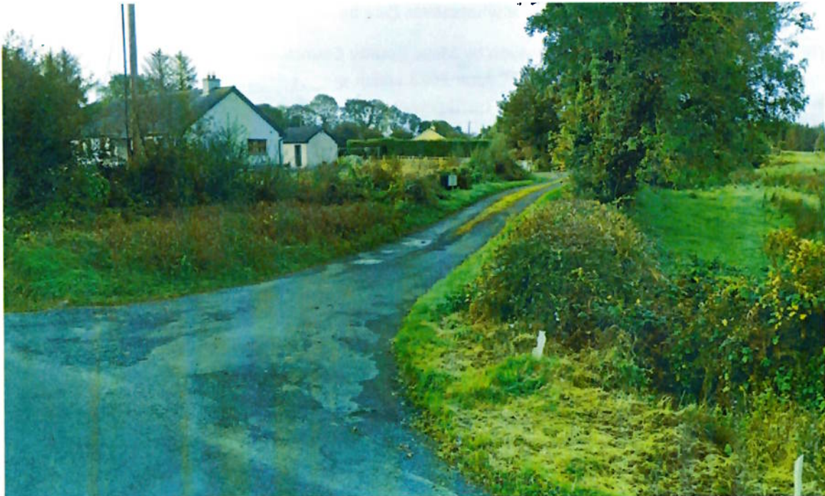
Fig2: Google Maps imagery dated 09/2019 illustrating no lay-by existed.

I would also like to note that it was falsely stated in Mr. Hunters letter that there was “an 8 ft layby, where 2 cars could pass”. I am baffled as to where the location of this ‘layby’ was. As you can see from the google earth photo below (Fig 2), there was never a layby. The only location that cars could ever pass was at our entrance, and this is still the case.